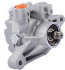
Part #: N990-0548 2006-11 Honda Civic, Civic Wagon