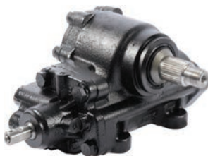
Part #: N503-0159 2002-06 Cadillac Trucks Escalade, Escalade EXT, Chevrolet/GMC Trucks Avalanche, Silverado SS, Sierra Denali; 2003-06 Cadillac Trucks Escalade ESV; 2001-06 Chevrolet/GMC Trucks Silverado, Sierra Series Pickup (2WD & 4WD), Suburban, Yukon XL, Yukon Denali, Yukon Denali XL, Tahoe, Blazer (Full Size), Jimmy (Full Size)