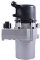
Part #: 980-0105E 2013 Buick Verano; 2013-14 Chevrolet Cruze