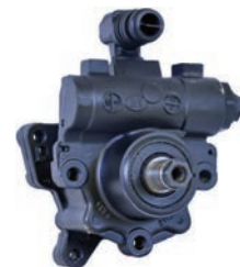
Part #: 990-1111 2011-12 Mercedes C300; 2011 Mercedes C350; 2010-11 Mercedes E350; E550

ADDED COVERAGE FOR OVER 50,000,000 VEHICLES!